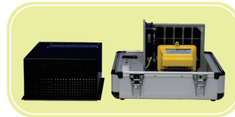
GES-33001 The lid can be separated